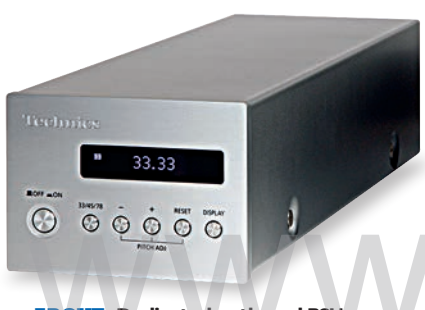
ABOVE: Dedicated outboard PSU delivers a synthesised feed for 33.33, 45 and 78rpm (with ±16% of adjustment). Speed is selected on the deck itself

The dynamic light and shade was profound, especially on the frenetic drum machine work. At the same time, the hi-hat cymbal – pretty much inaudible on most record players – eased out of the dense mix with utter insouciance. I duly sat transfixed as all the track's complex tiers of production unwrapped themselves before my ears. Despite the intensity of the sound, the strands effortlessly unravelled, with the clarinet solo towards the end of the song being far less strident than