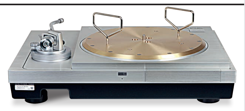
ABOVE: Two screw-in 'hoists' are supplied to lift/lower the heavy platter! High-quality 5-pin DIN (SME style) socket, with integral ground, is fitted under the rear of the chassis while the umbilical to the power supply/speed controller is captive

dynamics is enough to make you question the rhythmic security of high-end digital audio. The way this vinyl-spinner can extract both subtle accenting and dramatic dynamic contrasts from middling LP pressings never ceased to amaze me.