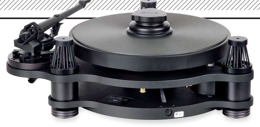
ABOVE: Socket for power supply cable is positioned at the back of lower baseplate; review sample shown with Series V arm, the tonearm cable socket visible below arm board 'wing' on sub-chassis; motor housing seen near pillar at right in photo

Most persuasive, though, even beyond the instruments, was Dylan's voice, a sound so distinctive that you'd recognise it over two tin cans and a piece of string. The rasp, the nasality: what was so chill-inducing was the intimacy – Dylan in your listening room. And behind him, a luscious mix of fluidity in the strings, contrasted with wheezy harmonica and percussion made to sound like orange crates. I had no idea so much was going on in this seemingly simple tune.