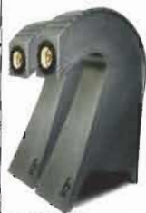
STEREO SPEAKERS Beauhorn B2 Rhapsody £2750 Page 80